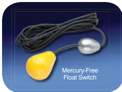
Mercury-Free Float Switch

AG Series pumps are the right choice to handle stringy trash, fibrous wastes, slurries and other difficult to pump solids without plugging. AG Series pumps have been field proven to provide reliable operation and dependable performance. BERKELEY offers a complete line of wastewater pumps, controls and accessories to meet your needs.