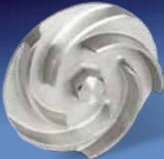
(Illustration purpose only)

Recessed impeller Handles stringy trash and slurries without clogging or binding. Pump out vanes help keep trash from seal; reduces pressure at seal faces.